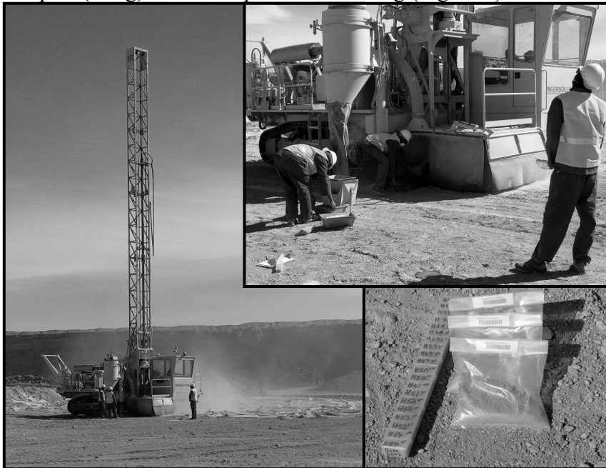
Figure 2. Blast-hole drilling and grade control sampling at the DM45 drill rig.

SAMPLING: Samples and drill chips are collected over intervals of 2.5m, 5m or 10m. Large samples (>5kg) are riffle split at the drill rig (Figure 2).