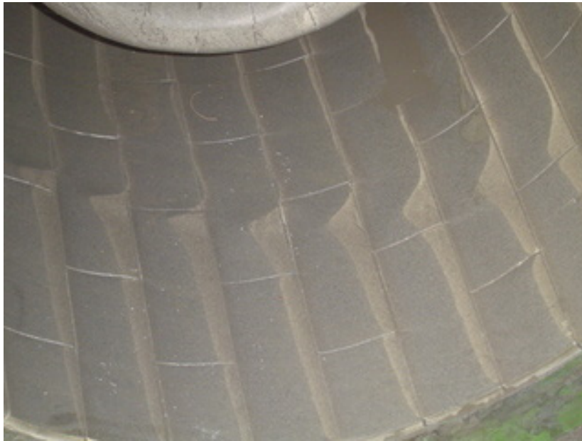
Figure 4 - Smooth wear pattern on cyclone inlet chamber