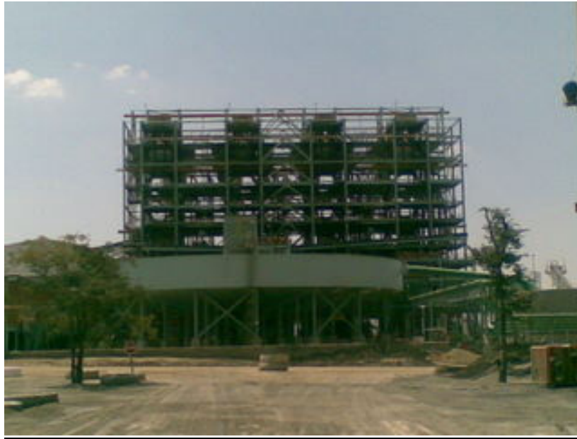
Figure 5 - Phase II DMS Plant