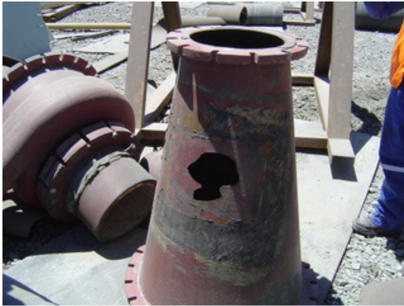
Figure 2: - Wear experienced on high chrome cyclone

Larger diameter spigots were supplied to overcome the over crowding effect. However, on fitting the spigot size required to accommodate a “worst case” scenario, with an 80% yield to spigot, there were periods when dropout occurred, resulting in a lower than expected product grade being produced. A smaller spigot was installed, to help resolve this problem. The cause of the problem is generally associated with too high medium density differentials. The density differential, which is calculated as the cyclone overflow RD divided by the cyclone feed RD, should be within the limits 4 – 9%. If the value exceeds 9%, the medium is too coarse, resulting in instability. If it is less than 4%, it is too viscous, as a result of slime contaminants. With density differentials which are too high, near dense material may find itself too light to report to the underflow, and too heavy to report to the overflow, resulting in it occupying a transition zone before being misplaced by the incoming feed, i.e. “dropout”.