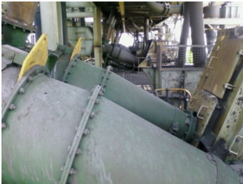
Figure 7 - 710mm DMS cyclone modules

The cyclone installation layout is shown below in Figure 7 .